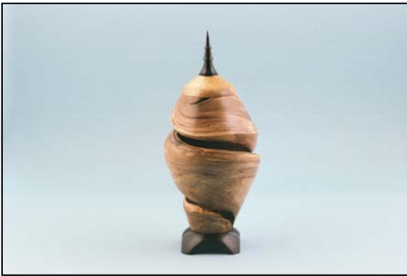
Unk. Vine, Ebony, Persimmon, 7" Ø x 15"