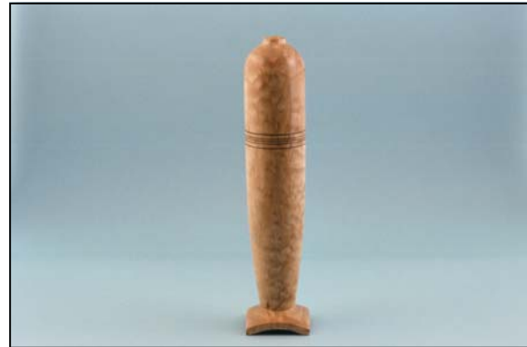
Quilted Maple, 18" Ø