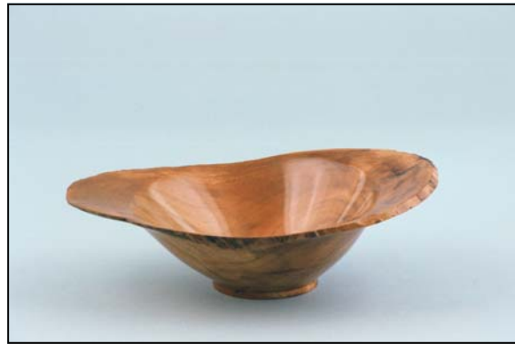
Japanese Cherry, 11" Ø