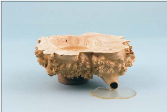
Maple, 11" Ø