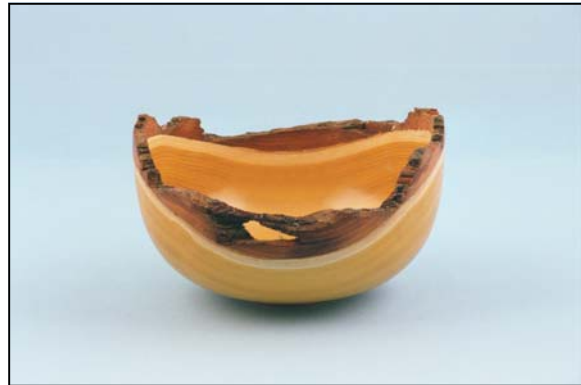
Osage Orange, 9" Ø