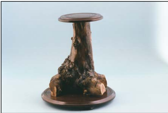
Dogwood and Walnut, 14" Ø x 18"