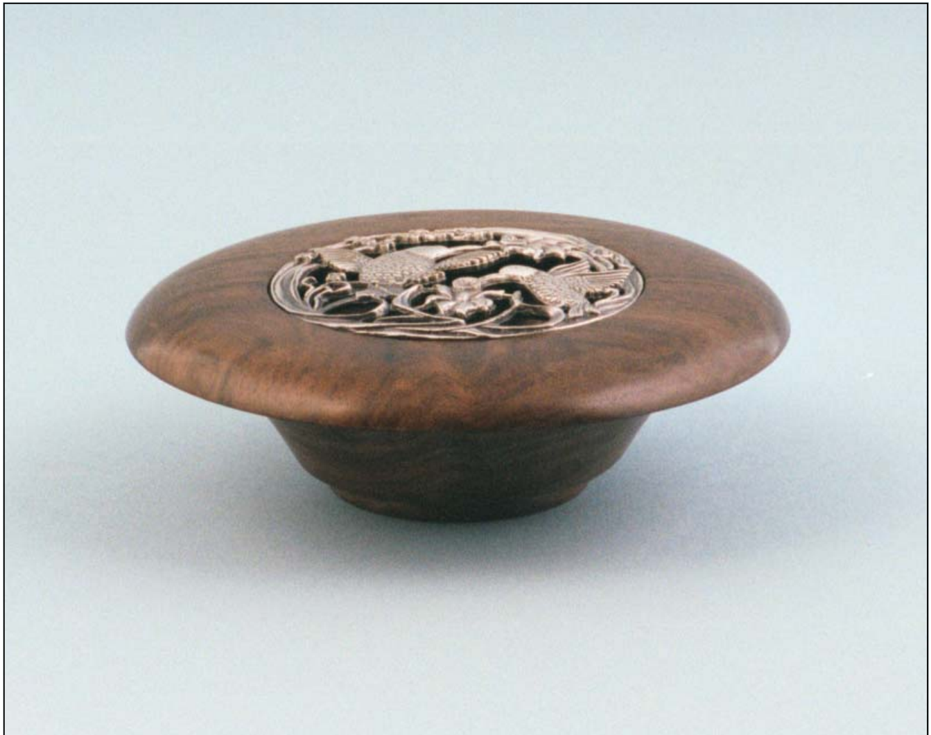
Black Walnut Bowl with Pewter Lid, 5"Ø by Michael Ehlen, Valdese, NC