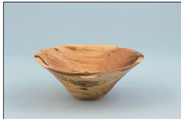
Pecan, 10" Ø