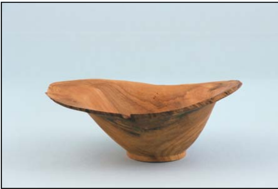
Japanese Cherry, 11" Ø