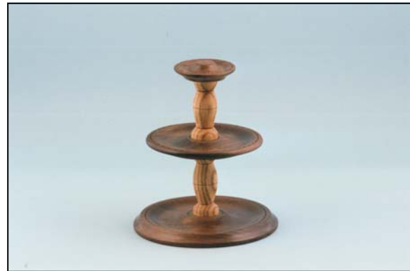
Oak and Walnut, 8" Ø x 10"