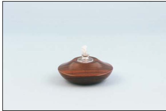
Cocobolo, 4" Ø