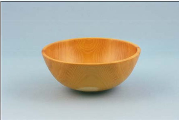
Osage Orange, 10" Ø