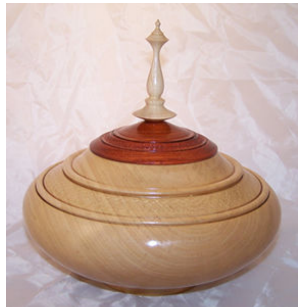
Ed Mackey - Maple & Padauk