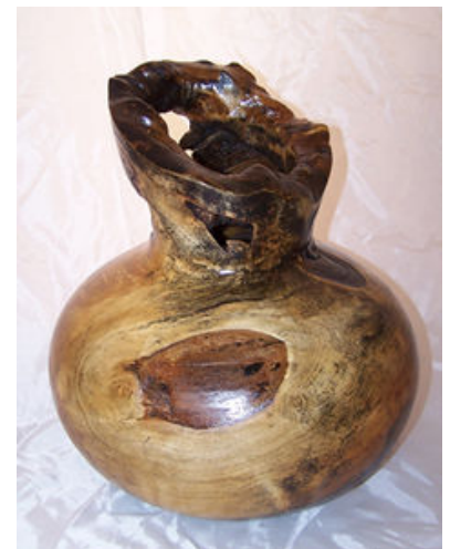
Jerry Ostrander - Maple