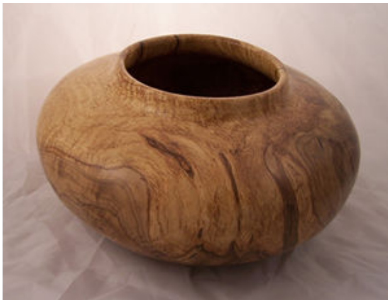
Gill Milsaps - Oak Burl