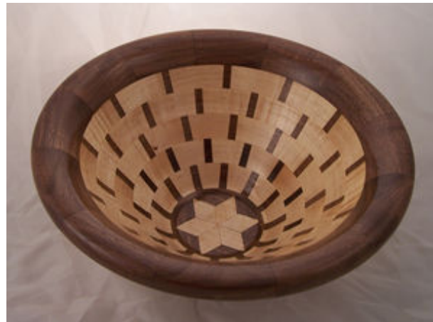
Stoney - Maple & Walnut - 150 pieces!