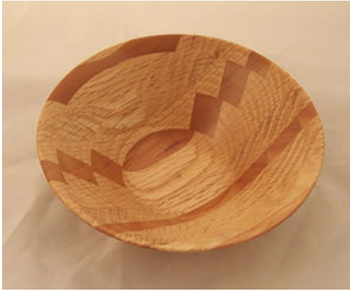
Harold Lineberger - Oak & Cherry